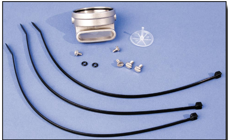
Components of the Quad Valve™ Cover kit.

The kit includes the quad exhaust cover that connects the exhaust whisker system to the helmet exhaust body, all required screws, tie wraps, and a replacement exhaust valve. Installation by a qualified KMDSI technician is recommended by Kirby Morgan®.