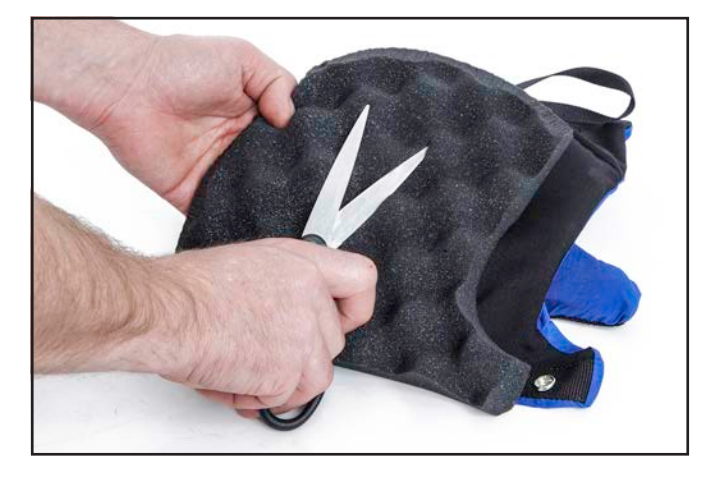
The tips of the "egg shell" side can be trimmed off if the side foams are too tight.

The side "egg shell" foams do not have ear holes. This is intentional. Ear holes may be cut in if preferred. The tips of the "egg shell" side can be trimmed off if the side foams are too tight.