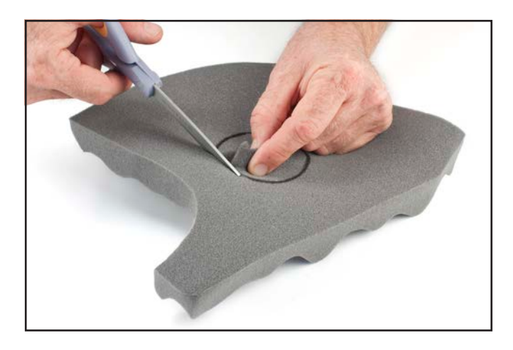
Trim the ear hole into the foam using the guide line made from the Ear Hole Template

Using the template for general size and location, mark the desired area for cut out, if required.