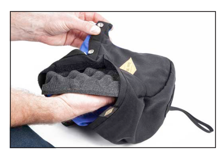
The "egg shell" side of the left and right side foams usually faces outward against the helmet shell.

First choose either the right or left side of the head cushion bag to begin stuffing the "egg shell" foam.