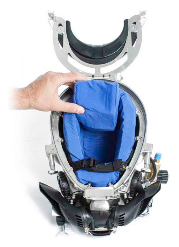
Hold the HCFS towards the back of the helmet when donning.