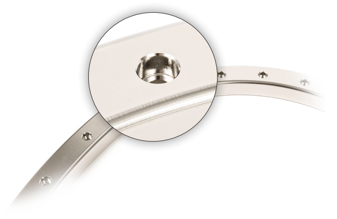
The current stainless steel stepped ring with rounded leading edges increases comfort when handling.

There will be no exchanges offered. The part number will remain the same, and there will be no change to the associated procedures for the maintenance of the stainless steel Stepped Ring necessary.