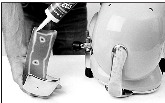
RTV (silicone sealant) is used to seal the weights to the helmet shell.