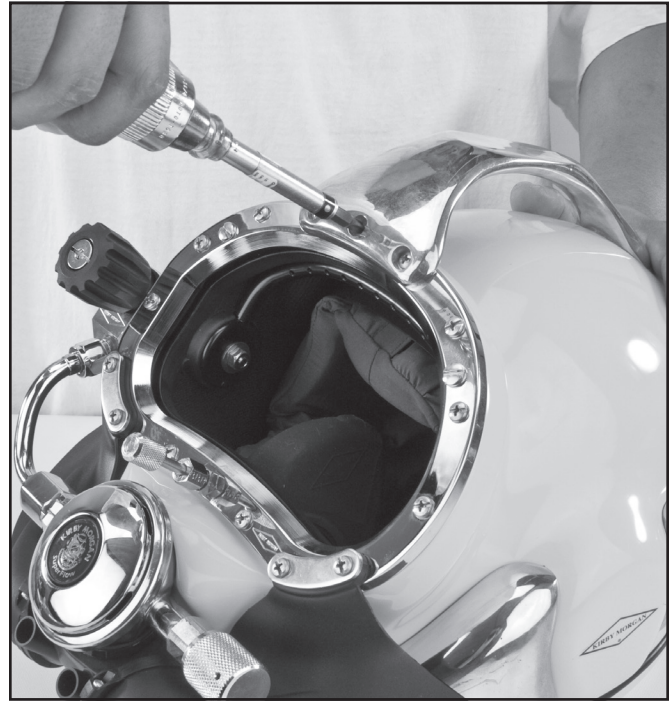
Use a torque screwdriver to tighten the front handle. See "Torque Specs" module.

5. Torque the front mount screws. See "Torque Specs" module.