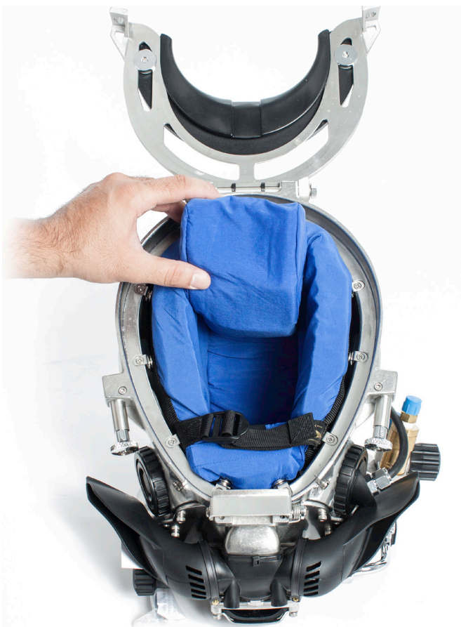
Hold the HCFS towards the back of the helmet when donning.