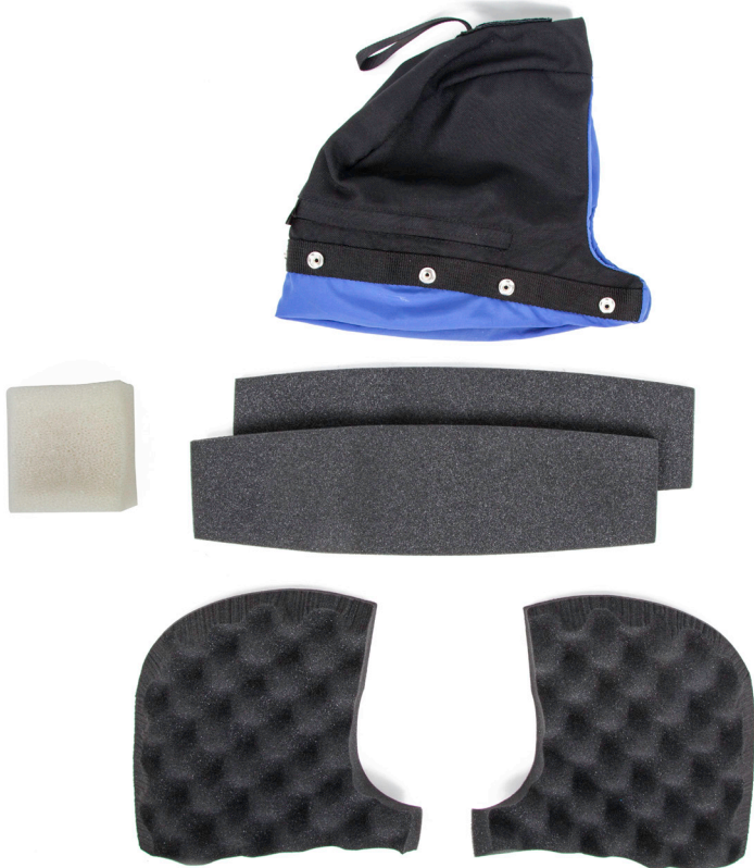
The components of the head cushion.

There are a number of ways to stuff the head cushion with foam. Different combinations of the provided foam can be set up and foam can be trimmed depending on desired fit. The below steps are intended to only aid and guide the user.