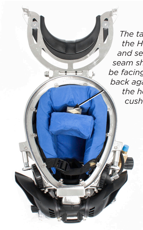
The tag on the HCFS and sewing seam should be facing the back against the head cushion.

1. Install the HCFS into the top inside portion of the head cushion. Wrap the elastic/Velcro® strap around the front top edge and attach onto the mating Velcro® patch in front of the hanging loop.