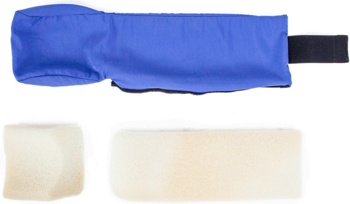
The components of the head cushion foam spacer (HCFS).