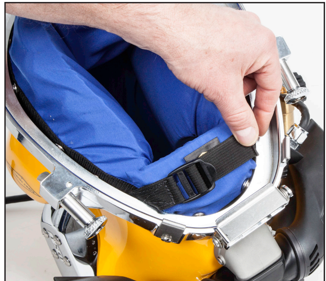
The chin strap is tightened on the outside of the chin cushion as to press the chin cushion snug against the divers chin.

The Chin cushion is fastened to the helmet with two snaps and should rest on the divers chin. The chin strap is tightened on the outside of the chin cushion as to press the chin cushion snug against the divers chin.