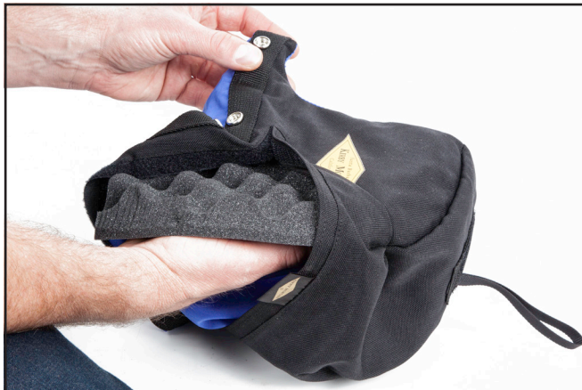
The “egg shell” side of the left and right side foams usually faces outward against the helmet shell.

Next insert the top foam, followed by the other side of “egg shell” foam and finish with the white neck foam pad.