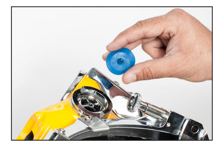
The water dump valve should be replaced at least annually.

2. The rubber exhaust valve should be replaced at the slightest sign of deterioration or aging of the rubber. Simply grasp the valve and pull to remove.