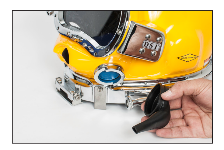
The water purge deflector is removed by cutting the tie wrap that holds it in place.

2. The rubber exhaust valve should be replaced at the slightest sign of deterioration or aging of the rubber. Simply grasp the valve and pull to remove.