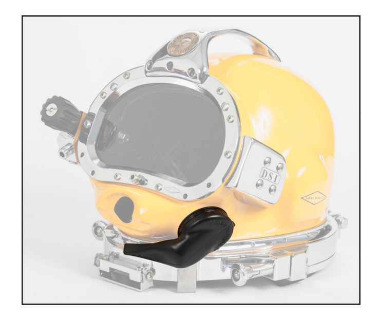
The water dump valve on the SuperLite<sup>*</sup> 27<sup>*</sup> is protected by the water purge deflector shown here.

2. When installing the water dump body be sure to never use longer screws than are called out on the exploded view. Longer screws will bottom out and may prevent the body from sealing properly against the helmet shell.