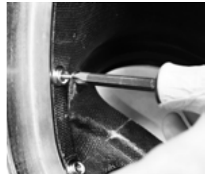
Fig: 1 A