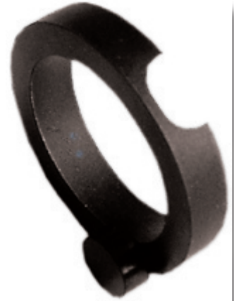
New Air Train Gasket

Note: This new product will NOT fit the KMB-28 Band Mask.