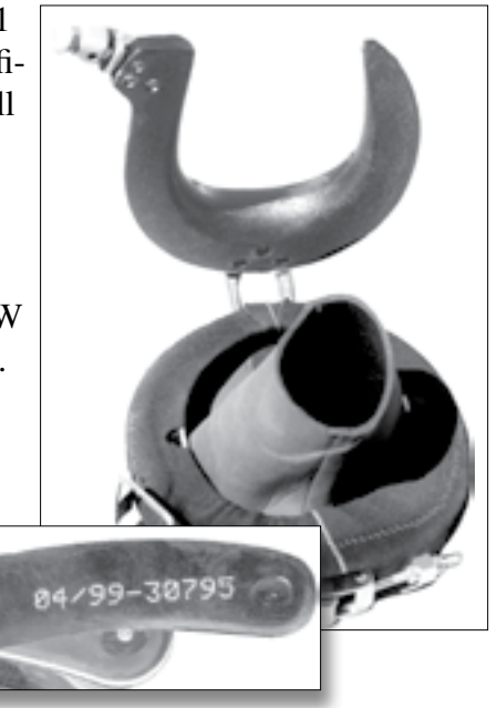
Early date stamp on neck clamp

If your neck clamp is not inscribed, it is older than 10 years and KMDSI strongly recommends that the neck clamp be replaced or be inspected IAW the above recommendation.