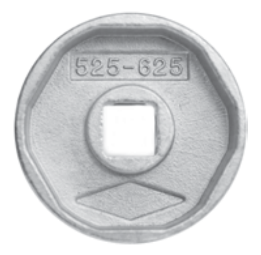
This side is used with the SuperLite 27, 17K Kirby Morgan® 37/57 and current BandMasks® which use the SuperFlow® 350 regulator, 505-069 and 505-560.

Products Affected: 525-620, Tool Kit w/Pouch