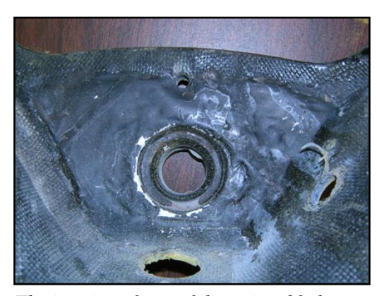
The interior of one of the painted helmets shows obvious sub-standard repair work.

These three helmets may not be the only ones that have been modified in this potentially dangerous way. Anyone noticing an irregular finish on the inside around the regulator mount as shown in the pictures, should not use the helmet and should