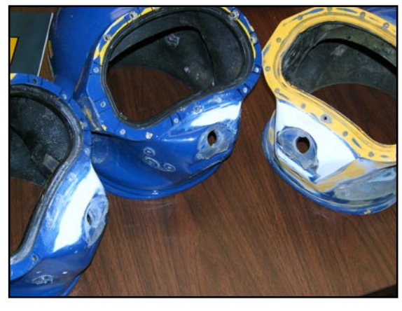
The unauthorized paint job on these helmets concealed repairs performed with substandard materials.

Please see the training and repair policies listed on the KMDSI and Dive Lab web sites for further information.