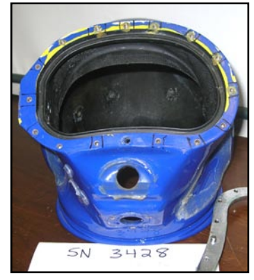
This is how the three stripped helmets appeared when they were received by the repair facility.

It was obvious that someone had performed extensive modifications to the helmets for some other use by completely changing the front end of the helmets. They then attempted to put the helmets back into their original configuration as SuperLite 17B's.