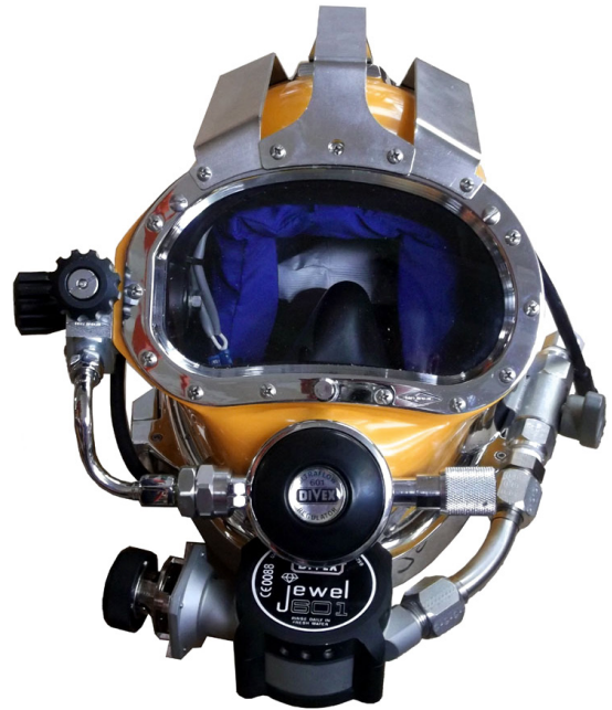
JFD/Divex Ultrajewel 601

All other breathing systems on the market ARE NOT APPROVED to be used with Kirby Morgan helmets and BandMask®.