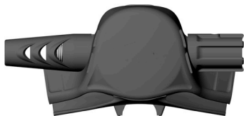
200-120 Balanced Scuba Regulator