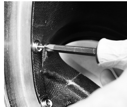
Fig: 1 A